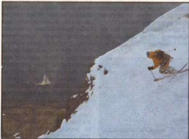
Following breakfast, Mohr and Johnson would climb away from one fjord and ski down into another as the boat would sail around to meet them.

Fjords region, helping local tourism authorities explore opportunities for backcountry skiing and human powered recreation. They used a 58-foot-long sailboat as a "floating basecamp" and rowed ashore each day to access the region's snow covered coastal mountains.